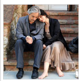
On the Road, Packing Querulous Erudition