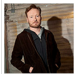
Conan in the Wilderness